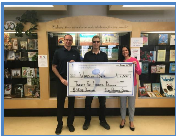
Wings of Power