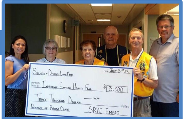
Selkirk & District Lion's Club Donates to Health Centre Emergency Room!