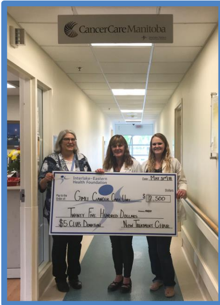
Gimli Cancer Care

The $5 Club is the IERHA's staff giving program where staff opt-in for a $5 payroll deduction to be used towards recommendations brought forward by the club. In the 2017/18 year, the $5 Club raised over $9,000 and was able to contribute $4,000 towards Project Echo, purchase a new treatment chair for the Gimli Cancer Care program and contribute $2,500 towards the breakfast program in Pine Falls!