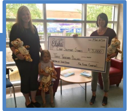
Arborg's Little Elsa Donates a Teddy Bear for each Camper at Camp Stepping Stones!